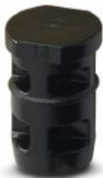
Filler plugs, length: 20 mm, diameter: 13 mm, color: black

Please be informed that the data shown in this PDF Document is generated from our Online Catalog. Please find the complete data in the user's documentation. Our General Terms of Use for Downloads are valid ( http://phoenixcontact.com/download )