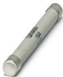
Fuse, 10.3 mm x 85 mm, up to 1500 V DC, gPV characteristic

Please be informed that the data shown in this PDF Document is generated from our Online Catalog. Please find the complete data in the user's documentation. Our General Terms of Use for Downloads are valid ( http://phoenixcontact.com/download )