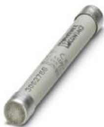
Fuse, 10.3 mm x 85 mm, up to 1200 V DC, gPV characteristic

Please be informed that the data shown in this PDF Document is generated from our Online Catalog. Please find the complete data in the user's documentation. Our General Terms of Use for Downloads are valid ( http://phoenixcontact.com/download )