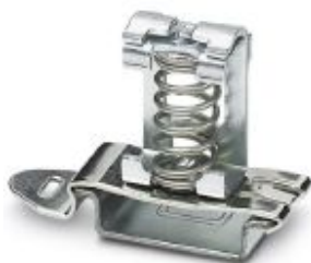
Shield connection terminal block, for applying the shield to busbars

Please be informed that the data shown in this PDF Document is generated from our Online Catalog. Please find the complete data in the user's documentation. Our General Terms of Use for Downloads are valid ( http://phoenixcontact.com/download )