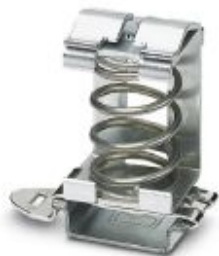
Shield connection terminal block, for applying the shield to busbars

Please be informed that the data shown in this PDF Document is generated from our Online Catalog. Please find the complete data in the user's documentation. Our General Terms of Use for Downloads are valid ( http://phoenixcontact.com/download )