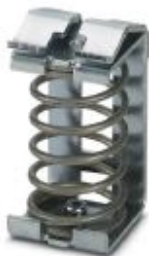
Shield connection terminal block, for applying the shield directly to the conductive mounting plates

Please be informed that the data shown in this PDF Document is generated from our Online Catalog. Please find the complete data in the user's documentation. Our General Terms of Use for Downloads are valid ( http://phoenixcontact.com/download )