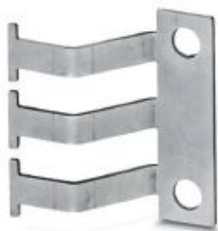
EMC cable catch rail

Please be informed that the data shown in this PDF Document is generated from our Online Catalog. Please find the complete data in the user's documentation. Our General Terms of Use for Downloads are valid ( http://phoenixcontact.com/download )