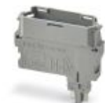
Component connector, for installing components that can be individually selected up to a diameter of 10 mm and power dissipation of up to 1 W, nominal current: 10 A, length: 41.2 mm, width: 12.3 mm, height: 37.5 mm, number of positions: 1, color: gray

Component connector - P-CO XL-UT - 3036799