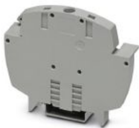
End clamp, width: 8.2 mm, height: 64 mm, material: PA, length: 80.8 mm, color: gray

Please be informed that the data shown in this PDF Document is generated from our Online Catalog. Please find the complete data in the user's documentation. Our General Terms of Use for Downloads are valid ( http://phoenixcontact.com/download )