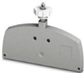
Cover profile carrier, width: 8 mm, height: 56.6 mm, material: PA, length: 80.9 mm, color: gray

Please be informed that the data shown in this PDF Document is generated from our Online Catalog. Please find the complete data in the user's documentation. Our General Terms of Use for Downloads are valid ( http://phoenixcontact.com/download )