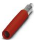
Female test connector, color: red

Female test connector - PSBJ-URTK 6 RD - 3026719