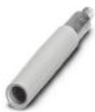
Female test connector, color: transparent

Female test connector - PSBJ-URTK 6 FARBLOS - 3026450