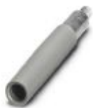
Female test connector, color: gray

Female test connector - PSBJ-URTK 6 GY - 3026612