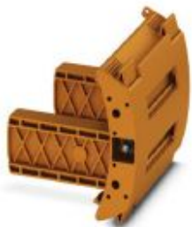
Dummy plug, color: orange

Please be informed that the data shown in this PDF Document is generated from our Online Catalog. Please find the complete data in the user's documentation. Our General Terms of Use for Downloads are valid ( http://phoenixcontact.com/download )