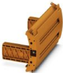
Dummy plug, color: orange

Please be informed that the data shown in this PDF Document is generated from our Online Catalog. Please find the complete data in the user's documentation. Our General Terms of Use for Downloads are valid ( http://phoenixcontact.com/download )