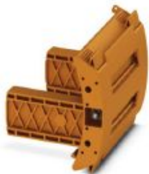
Dummy plug, color: orange

Please be informed that the data shown in this PDF Document is generated from our Online Catalog. Please find the complete data in the user's documentation. Our General Terms of Use for Downloads are valid ( http://phoenixcontact.com/download )