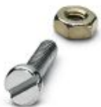
Screw, for attaching cable lugs to FAME test plugs, with cover, without test point, length: 4.5 mm, color: silver/black

Female test connector - PSBJ-URTK 6 FARBLOS - 3026450