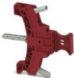
Test plug, number of positions: 1, width: 9 mm, color: red

Please be informed that the data shown in this PDF Document is generated from our Online Catalog. Please find the complete data in the user's documentation. Our General Terms of Use for Downloads are valid ( http://phoenixcontact.com/download )