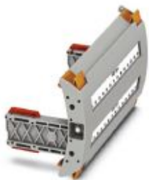
Dummy plug, VDE coded type B14, pitch: 8.2 mm, length: 81 mm, width: 146.7 mm, number of positions: 14, color: gray

Please be informed that the data shown in this PDF Document is generated from our Online Catalog. Please find the complete data in the user's documentation. Our General Terms of Use for Downloads are valid ( http://phoenixcontact.com/download )