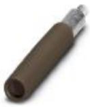
Female test connector, color: brown

Female test connector - PSBJ-URTK 6 BN - 3026971