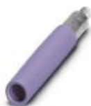
Female test connector, color: violet

Female test connector - PSBJ-URTK 6 VT - 3026421