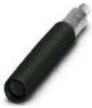
Female test connector, color: black

Female test connector - PSBJ-URTK 6 BK - 3026447