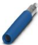
Female test connector, color: blue

Female test connector - PSBJ-URTK 6 BU - 3026434