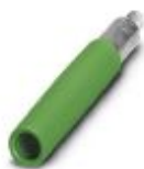
Female test connector, color: green

Female test connector - PSBJ-URTK 6 GN - 3026418