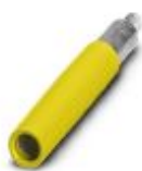
Female test connector, color: yellow

Female test connector - PSBJ-URTK 6 YE - 3026405