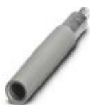
Female test connector, color: gray

Female test connector - PSBJ-URTK 6 GY - 3026612