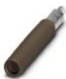
Female test connector, color: brown

Female test connector - PSBJ-URTK 6 BN - 3026971