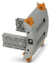
Dummy plug, color: gray

Please be informed that the data shown in this PDF Document is generated from our Online Catalog. Please find the complete data in the user's documentation. Our General Terms of Use for Downloads are valid ( http://phoenixcontact.com/download )