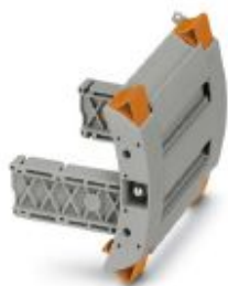
Dummy plug, color: gray

Please be informed that the data shown in this PDF Document is generated from our Online Catalog. Please find the complete data in the user's documentation. Our General Terms of Use for Downloads are valid ( http://phoenixcontact.com/download )