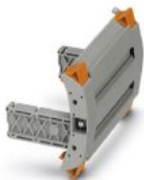
Dummy plug, pitch: 8.2 mm, length: 72.9 mm, width: 114.4 mm, number of positions: 10, color: gray

Please be informed that the data shown in this PDF Document is generated from our Online Catalog. Please find the complete data in the user's documentation. Our General Terms of Use for Downloads are valid ( http://phoenixcontact.com/download )