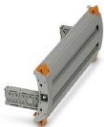
Dummy plug, color: gray

Please be informed that the data shown in this PDF Document is generated from our Online Catalog. Please find the complete data in the user's documentation. Our General Terms of Use for Downloads are valid ( http://phoenixcontact.com/download )