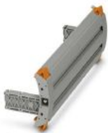
Dummy plug, color: gray

Please be informed that the data shown in this PDF Document is generated from our Online Catalog. Please find the complete data in the user's documentation. Our General Terms of Use for Downloads are valid ( http://phoenixcontact.com/download )