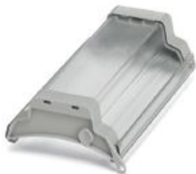
Cover profile, can optionally be sealed, length: 114 mm, width: 74.1 mm, height: 32 mm, color: transparent

Please be informed that the data shown in this PDF Document is generated from our Online Catalog. Please find the complete data in the user's documentation. Our General Terms of Use for Downloads are valid ( http://phoenixcontact.com/download )