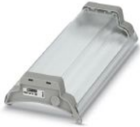
Cover profile, can optionally be sealed, length: 147 mm, width: 74.1 mm, height: 32 mm, color: transparent

Please be informed that the data shown in this PDF Document is generated from our Online Catalog. Please find the complete data in the user's documentation. Our General Terms of Use for Downloads are valid ( http://phoenixcontact.com/download )