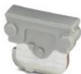
Feed-through connector, length: 10.5 mm, width: 4 mm, color: gray

Feed-through connector - P-FIX - 3038956