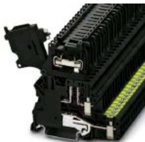
Lever-type fuse terminal block, black, for 5 x 20 mm G fuse inserts, with LED for 60 V DC

Please be informed that the data shown in this PDF Document is generated from our Online Catalog. Please find the complete data in the user's documentation. Our General Terms of Use for Downloads are valid ( http://phoenixcontact.com/download )