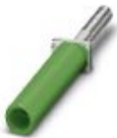
Female test connector, color: green

Female test connector - PSBJ-URTK/S GN - 0311760