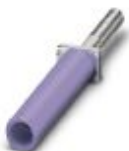
Female test connector, color: violet

Female test connector - PSBJ-URTK/S VT - 0311773