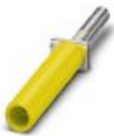
Female test connector, color: yellow

Female test connector - PSBJ-URTK/S YE - 0311731