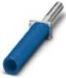
Female test connector, color: blue

Female test connector - PSBJ-URTK/S BU - 0311757