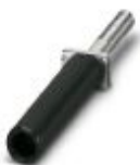
Female test connector, color: black

Female test connector - PSBJ-URTK/S BK - 0311728