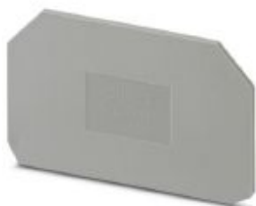
End cover, length: 72.6 mm, width: 2.2 mm, height: 43.6 mm, color: gray

Please be informed that the data shown in this PDF Document is generated from our Online Catalog. Please find the complete data in the user's documentation. Our General Terms of Use for Downloads are valid ( http://phoenixcontact.com/download )