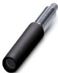
Female test connector, color: black

Please be informed that the data shown in this PDF Document is generated from our Online Catalog. Please find the complete data in the user's documentation. Our General Terms of Use for Downloads are valid ( http://phoenixcontact.com/download )