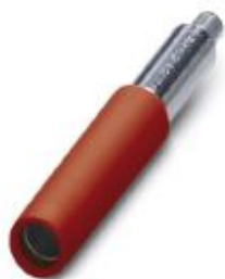
Female test connector, color: red

Please be informed that the data shown in this PDF Document is generated from our Online Catalog. Please find the complete data in the user's documentation. Our General Terms of Use for Downloads are valid ( http://phoenixcontact.com/download )