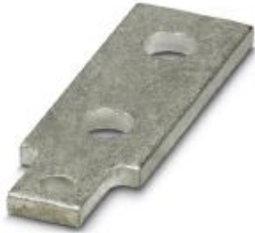
Connection element, number of positions: 3, color: silver

Please be informed that the data shown in this PDF Document is generated from our Online Catalog. Please find the complete data in the user's documentation. Our General Terms of Use for Downloads are valid ( http://phoenixcontact.com/download )