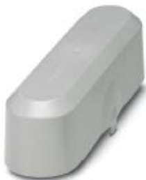
Cover, packed in pairs, length: 214 mm, width: 63 mm, height: 54.5 mm, color: gray

Please be informed that the data shown in this PDF Document is generated from our Online Catalog. Please find the complete data in the user's documentation. Our General Terms of Use for Downloads are valid ( http://phoenixcontact.com/download )