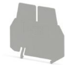
Separating plate, length: 66.5 mm, width: 1 mm, height: 62.5 mm, color: gray

Please be informed that the data shown in this PDF Document is generated from our Online Catalog. Please find the complete data in the user's documentation. Our General Terms of Use for Downloads are valid ( http://phoenixcontact.com/download )