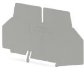
Separating plate, length: 105.2 mm, width: 1 mm, height: 67.5 mm, color: gray

Please be informed that the data shown in this PDF Document is generated from our Online Catalog. Please find the complete data in the user's documentation. Our General Terms of Use for Downloads are valid ( http://phoenixcontact.com/download )