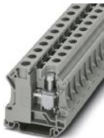
Installation terminal block, Screw connection, cross section: 6 mm 2 - 25 mm 2 , AWG: 10 - 4, width: 12.2 mm, color: gray, mounting type: NS 35/7,5, NS 35/15

Please be informed that the data shown in this PDF Document is generated from our Online Catalog. Please find the complete data in the user's documentation. Our General Terms of Use for Downloads are valid ( http://phoenixcontact.com/download )