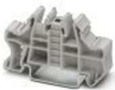
Quick mounting end clamp for NS 35/7,5 DIN rail or NS 35/15 DIN rail, with marking option, width: 9.5 mm, color: gray