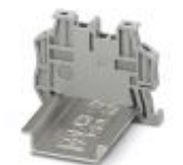
Quick mounting end clamp for NS 35/7,5 DIN rail or NS 35/15 DIN rail, with marking option, with parking option for FBS...5, FBS...6, KSS 5, KSS 6, width: 5.15 mm, color: gray