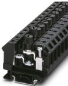
Fuse terminal block for cartridge fuse insert, cross section: 0.5 - 16 mm 2 , AWG: 24 - 6, width: 12 mm, color: black

Please be informed that the data shown in this PDF Document is generated from our Online Catalog. Please find the complete data in the user's documentation. Our General Terms of Use for Downloads are valid ( http://phoenixcontact.com/download )