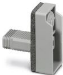
Mounting material, number of positions: 0, color: gray

Please be informed that the data shown in this PDF Document is generated from our Online Catalog. Please find the complete data in the user's documentation. Our General Terms of Use for Downloads are valid ( http://phoenixcontact.com/download )