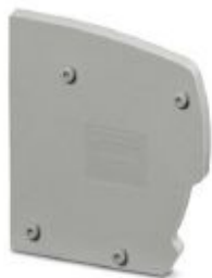
Spacer plate, number of positions: 0, pitch: 0 mm, color: gray

Please be informed that the data shown in this PDF Document is generated from our Online Catalog. Please find the complete data in the user's documentation. Our General Terms of Use for Downloads are valid ( http://phoenixcontact.com/download )