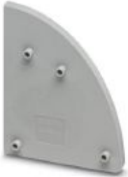
Spacer plate, number of positions: 0, pitch: 0 mm, color: gray

Please be informed that the data shown in this PDF Document is generated from our Online Catalog. Please find the complete data in the user's documentation. Our General Terms of Use for Downloads are valid ( http://phoenixcontact.com/download )