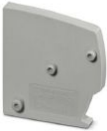
Spacer plate, number of positions: 0, pitch: 0 mm, color: gray

Please be informed that the data shown in this PDF Document is generated from our Online Catalog. Please find the complete data in the user's documentation. Our General Terms of Use for Downloads are valid ( http://phoenixcontact.com/download )