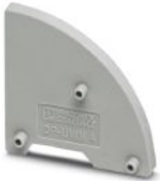
Spacer plate, number of positions: 0, pitch: 0 mm, color: gray

Please be informed that the data shown in this PDF Document is generated from our Online Catalog. Please find the complete data in the user's documentation. Our General Terms of Use for Downloads are valid ( http://phoenixcontact.com/download )