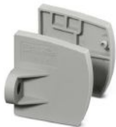
Flange, number of positions: 0, color: gray

Please be informed that the data shown in this PDF Document is generated from our Online Catalog. Please find the complete data in the user's documentation. Our General Terms of Use for Downloads are valid ( http://phoenixcontact.com/download )