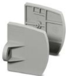
Flange, number of positions: 0, color: gray

Please be informed that the data shown in this PDF Document is generated from our Online Catalog. Please find the complete data in the user's documentation. Our General Terms of Use for Downloads are valid ( http://phoenixcontact.com/download )