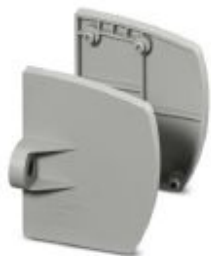
Flange, number of positions: 0, color: gray

Please be informed that the data shown in this PDF Document is generated from our Online Catalog. Please find the complete data in the user's documentation. Our General Terms of Use for Downloads are valid ( http://phoenixcontact.com/download )