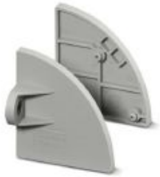
Flange, number of positions: 0, color: gray

Please be informed that the data shown in this PDF Document is generated from our Online Catalog. Please find the complete data in the user's documentation. Our General Terms of Use for Downloads are valid ( http://phoenixcontact.com/download )