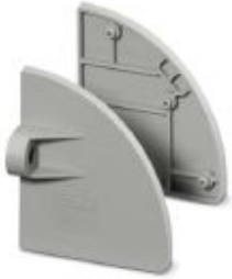
Flange, number of positions: 0, color: gray

Please be informed that the data shown in this PDF Document is generated from our Online Catalog. Please find the complete data in the user's documentation. Our General Terms of Use for Downloads are valid ( http://phoenixcontact.com/download )