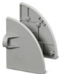
Flange, number of positions: 0, color: gray

Please be informed that the data shown in this PDF Document is generated from our Online Catalog. Please find the complete data in the user's documentation. Our General Terms of Use for Downloads are valid ( http://phoenixcontact.com/download )